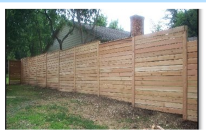
Horizontal Wood Boards