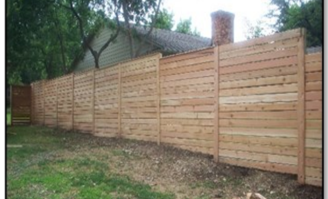
Horizontal Wood Boards