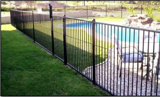
Metal with Vertical Pickets

Certain restrictions and Conditions may apply to these options. If you are considering a fencing option that is not listed under the `Fencing Requirements` section of this application, Contact Building Department to determine if these solutions will be accepted.