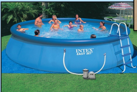
Soft-Walled Blow-Up Pool